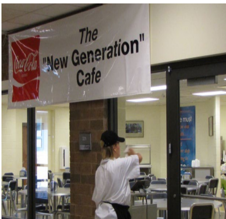
Basic food service 12