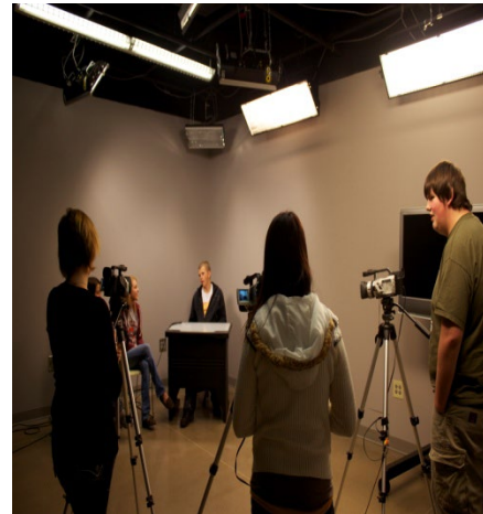
(ITIM)/(ITAP) Information Technology/Interactive Media