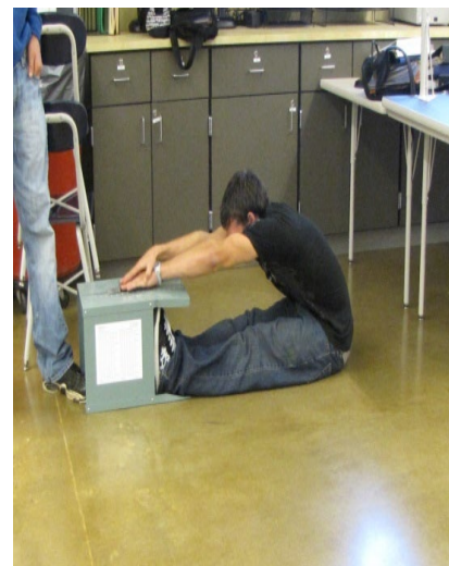
Public Safety 12