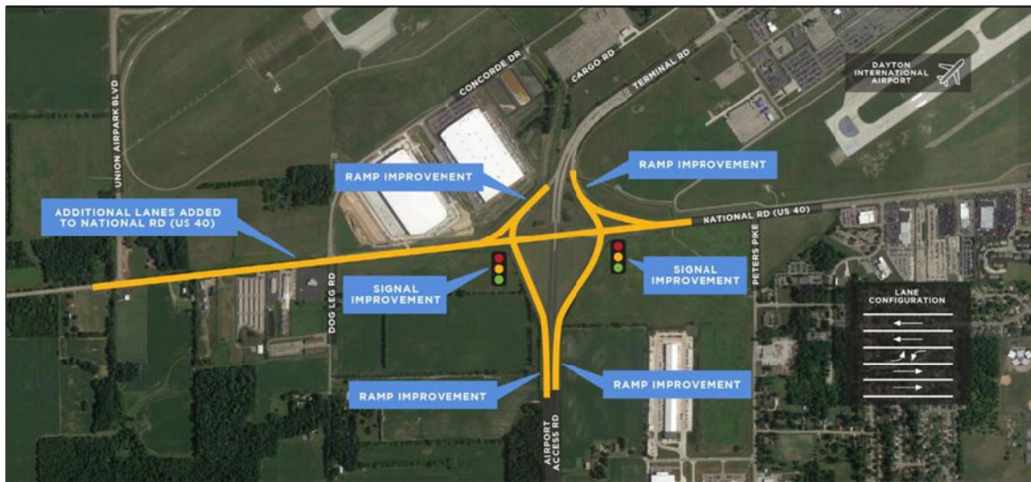
US 40 improvement currently under construction

For the Fiscal Year Ended December 31, 2020