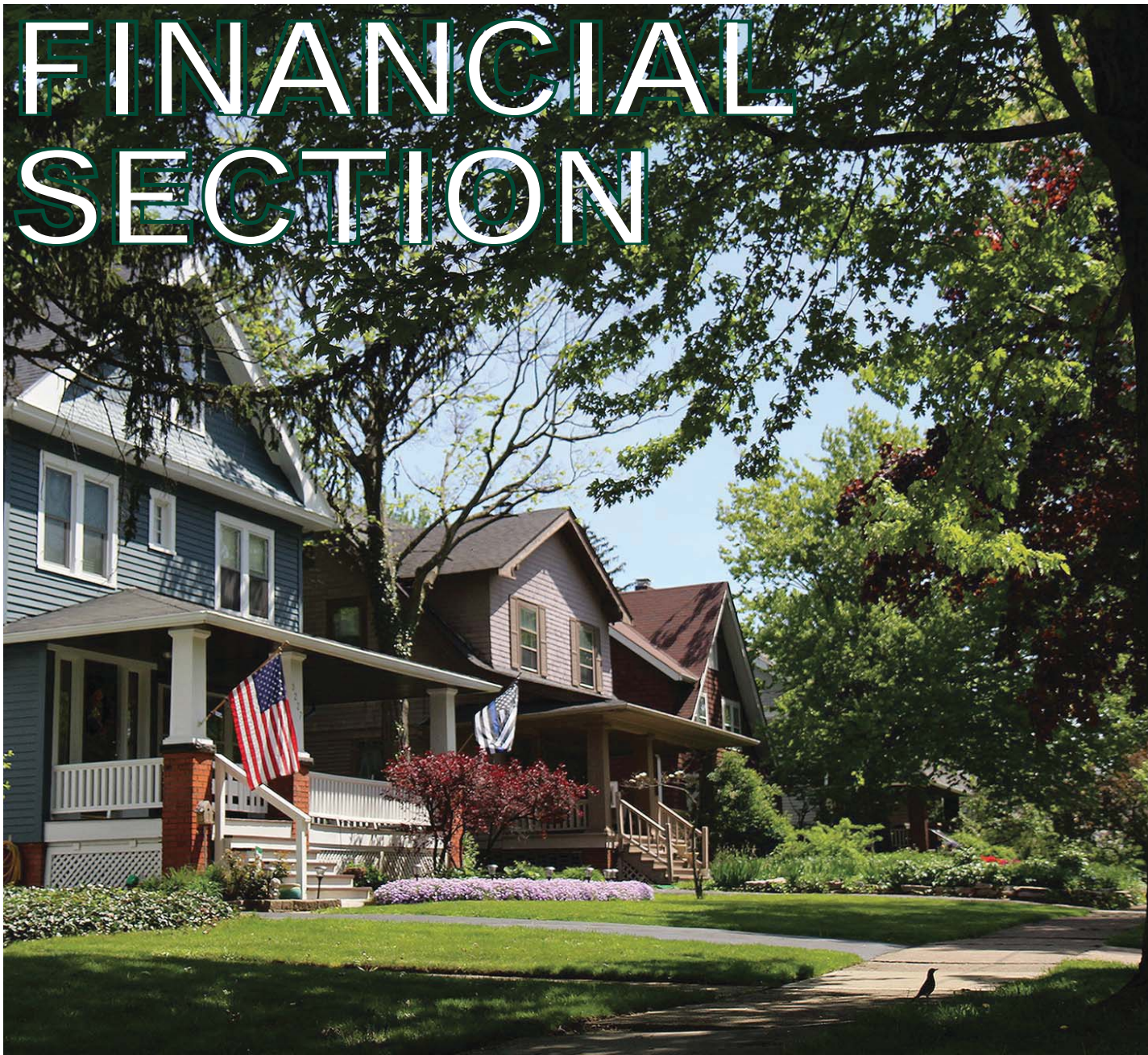
Summer On A Quiet Street