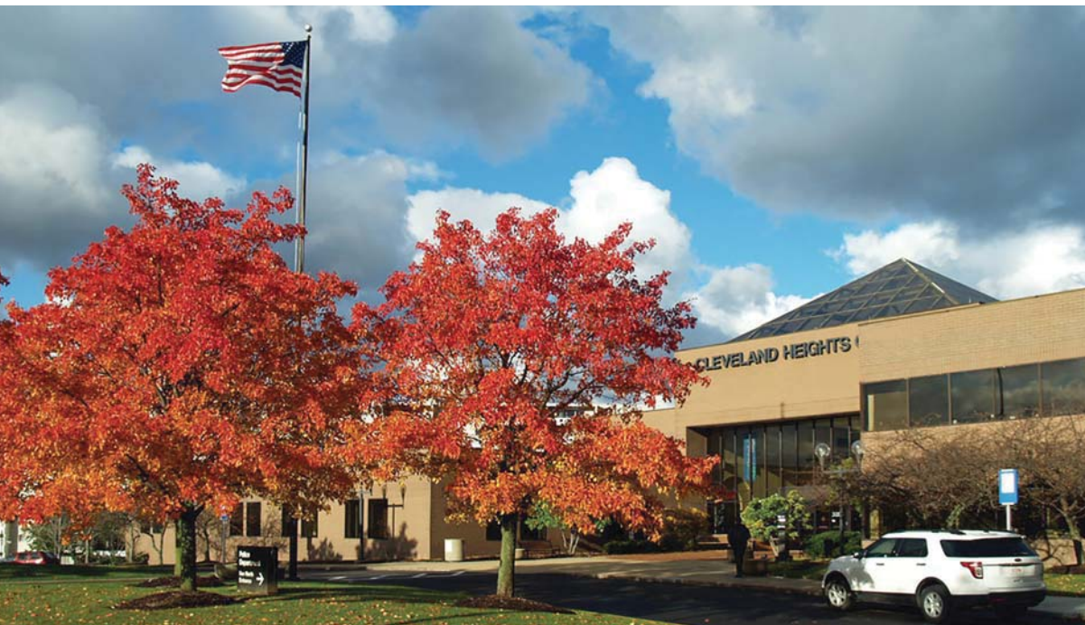
Fall at City Hall