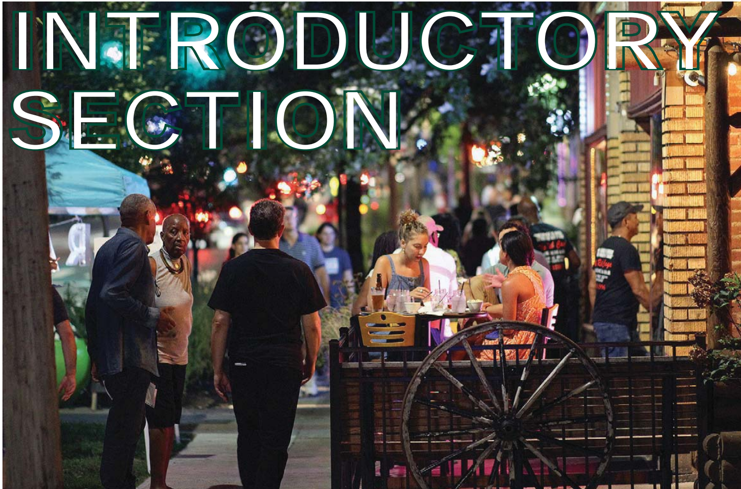
Activity fills Lee Road in the summer

Cleveland Heights beautiful parks beautiful community