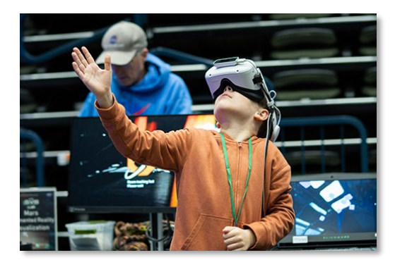
A young customer explores virtual reality at a library program

Throughout the year, the Library partnered with the Greater Cleveland Food Bank to provide monthly mobile pantry food distribution events at nine branches. These events provided county residents in need with fresh produce and shelf stable food items that represented 256,023 meals. While many of the residents served by the mobile pantry were seniors on fixed incomes, nearly half of residents served (46.47 percent) reported having minor children in their households. In collaboration with the Greater Cleveland Food Bank, the Library served 25,217 after-school meals through the Kids Café program and 5,566 summer lunches.