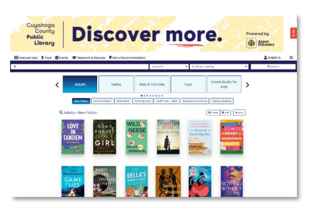
CCPL debuted a new catalog experience in 2023

This was a major operational change as Library staff had 20 years of experience using our previous catalog system. An enormous amount of complex data was migrated to the new catalog system, including 456,569 customer records, 217,000 bibliographic records and more than 1.3 million item records. This new system will benefit the Library and its customers for many years to come.