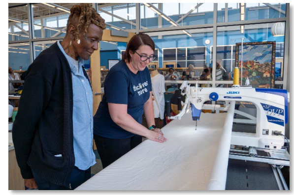
A library staff member demonstrates Innovation Center equipment at the Warrensville Heights Branch

In 2022, the Library adopted a new Facilities Master Plan (FMP) to guide the next decade of facilities investments and ensure its branches continue to provide excellent service, equitable access and engaging experiences. The FMP included recommendations for major building renovation and replacement projects. The Library made progress on several of those projects in 2023. Most notably, construction began for a new, 25,000-square-foot Brooklyn Branch on Memphis Avenue across from Brooklyn's beautiful new City Center. In addition to an Innovation Center, the new branch will include an interactive children's area, meeting rooms, study rooms, a drive-up window and a dedicated Pearson Vue testing center where customers can take the GED<sup>®</sup>/High School Equivalency Diploma test. The center will also offer certification and licensure exams for careers in a variety of industries.