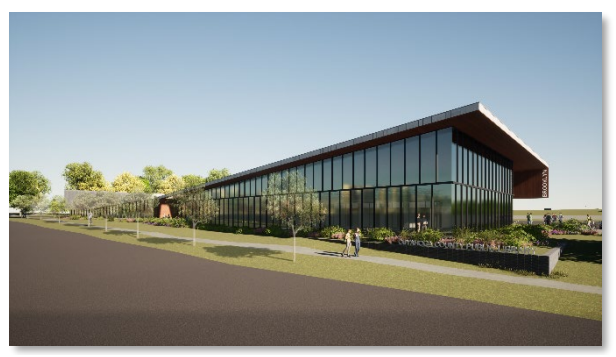
Rendering of the new CCPL Brooklyn Branch

Additionally, the teen area in the North Olmsted branch received a much-needed renovation. Located across from North Olmsted High School, the branch is a popular after-school destination for students. The renovated space is better able to accommodate the high level of afterschool activity and meet students' needs.