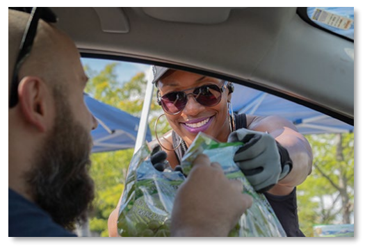
A volunteer hands out free produce at a Library Mobile Pantry event