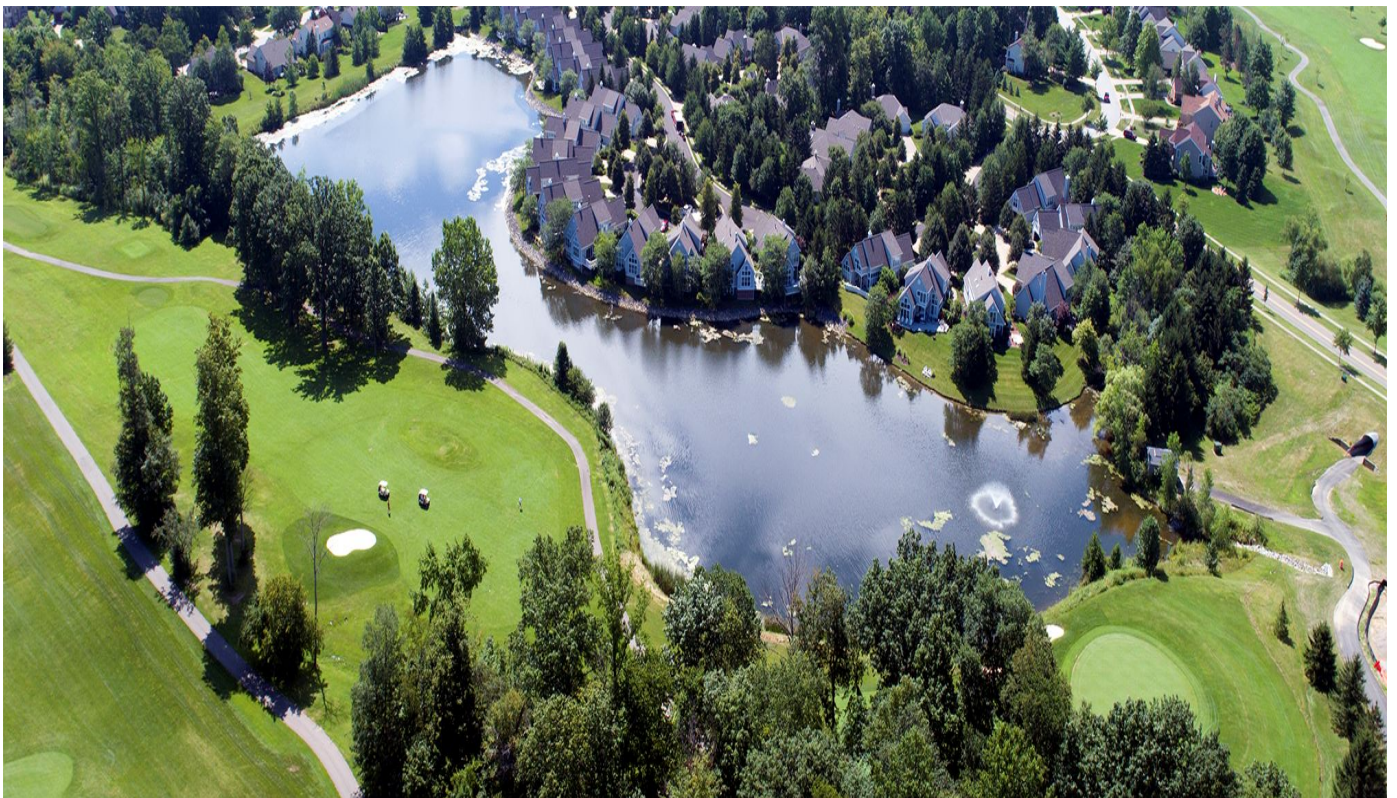
Aerial View of Gleneagles Golf Club