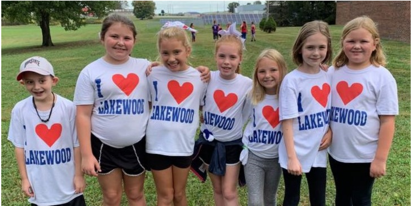
Students Supporting Lakewood

Lakewood Local School District Hebron, Ohio