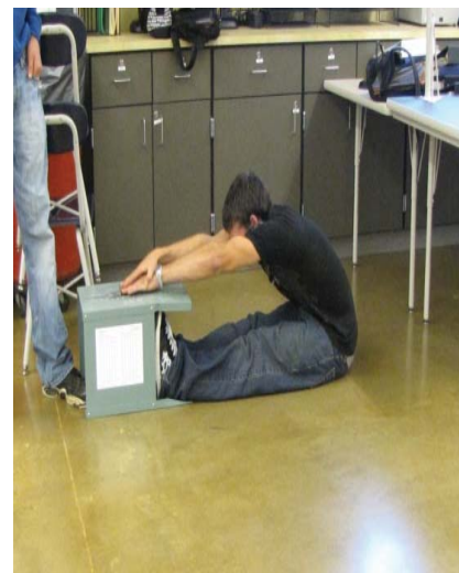
Public Safety 12