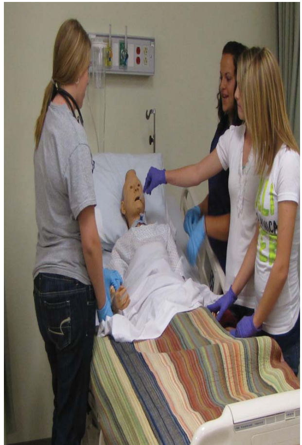
Patient Care Technician 12