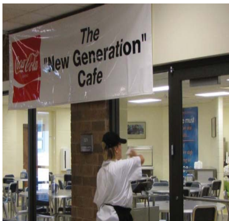
Basic food service 12