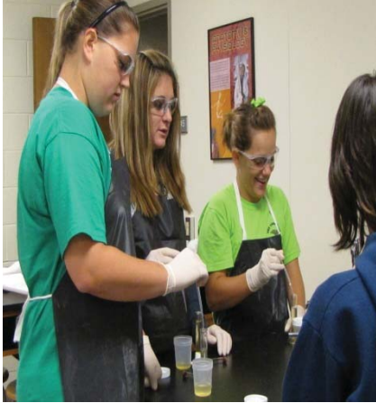
Patient Care Technician 11