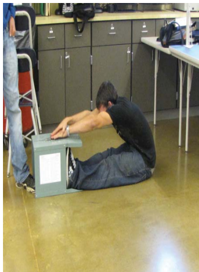
Public Safety 11