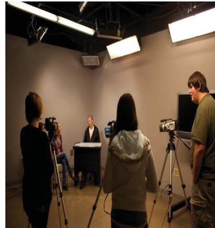
(ITIM)/(ITAP) Information Technology/Interactive Media