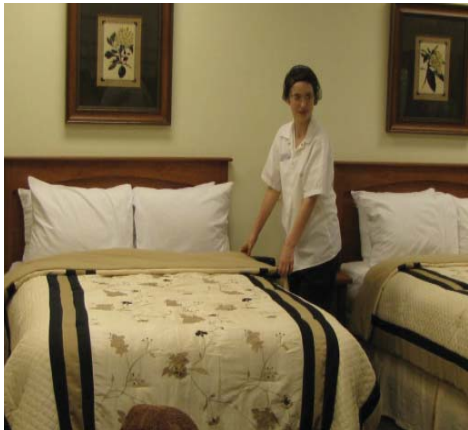
Hospitality and Facility Care 11