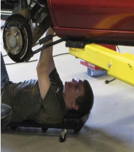
Automotive 11 & 12