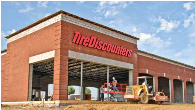
NEW TIREDISCOUNTERS LOCATED OFF STATE ROUTE 63 ON THE EAST SIDE OF INTERSTATE 75