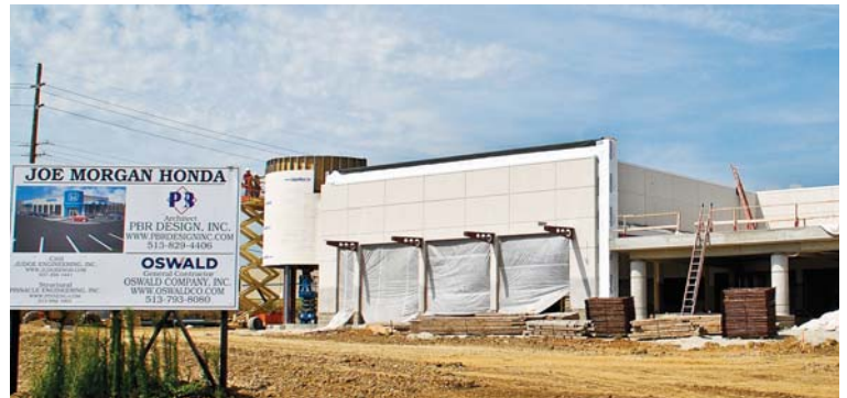
THE CITY'S FIRST MAJOR CAR DEALERSHIP LOCATED ON NORTHEAST CORNER STATE ROUTE 63 RAMP AT INTERSTATE 75