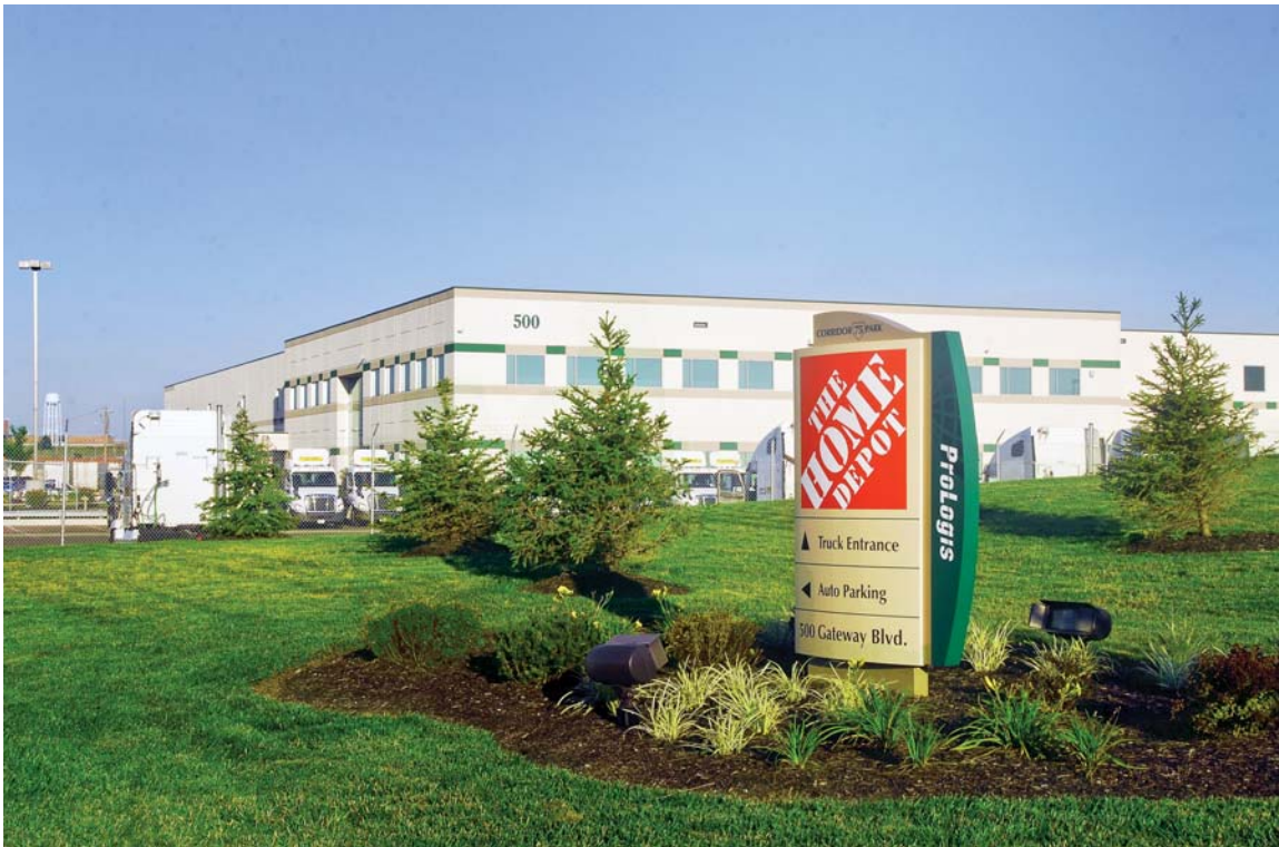
HOME DEPOT DISTRIBUTION BUILDING LOCATED IN THE NEW BUSINESS PARK